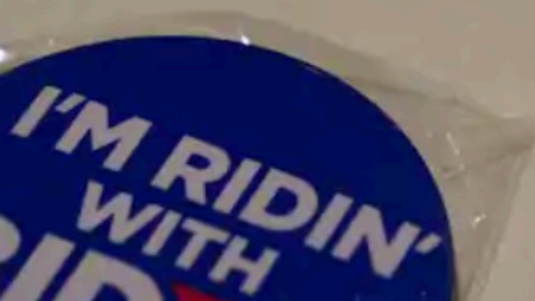
Leadership Board Meeting 2020.12.13